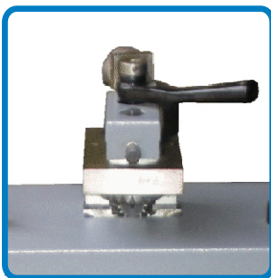
Optional auto-guide power flanging attachment

These heads are supported on aesthetically pleasing cabinet made from heavy gauge steel. The Pittsburgh lock seam rolls are fitted between side plates. The machine is provided with outboard extension shafts on to which axillary rolls can be fitted.